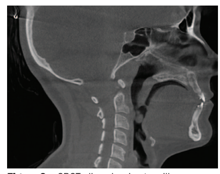
Figure 3a: CBCT slice showing tonsillar hypertrophy.

It may seem obvious once it is stated, but breathing is really important. There are two reasons we need to breathe – the first