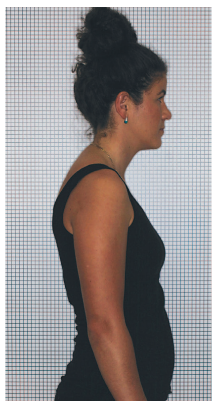
Figure 3b: Postural effects of mouth breathing.

is to get oxygen from the air into our blood circulation, and the second is to breathe out a waste product of cell metabolism called carbon dioxide. Viii If we do not get enough oxygen in, or cannot clear out the carbon dioxide, then our whole bodies will start to malfunction, and that can be fatal.