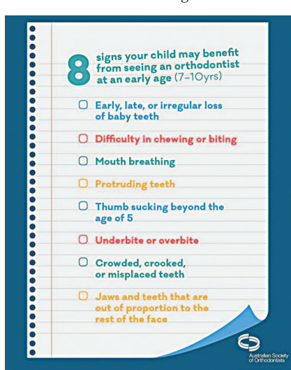
Figure 1: The ASO now recognises the role of mouth breathing in the development of malocclusion. iii

ENT specialists have long accepted the effects of mouth breathing on craniofacial