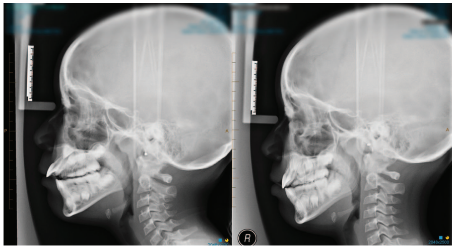
Before treatment (left), 6 months after treatment with the Myobrace® K1 and K2 appliances (right).

orthodontic treatment may have helped open the upper airway. I do not have enough reason to convince myself about the need of